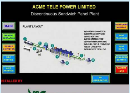
VEG VAG POLYTECH PVT. LTD.